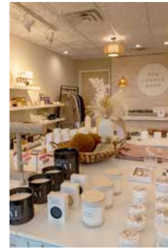
The Lounge Shop