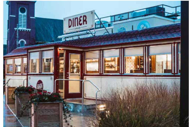
The Swan Street Diner, open daily for breakfast and lunch.