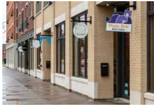
Millrace Commons streetscape, 799 Seneca St., steps from the Larkin at Exchange Building.

A block east, two buildings opened with six apartments and Paula's Donuts on the ground floor. DA Taste Taco will be opening in 2023.