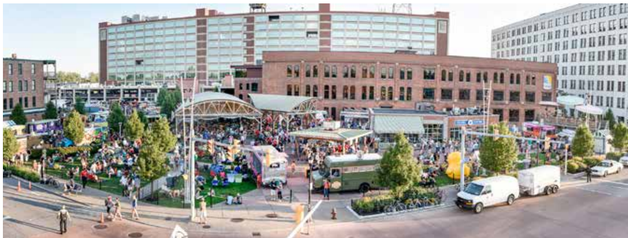
Larkin Square, home to Food Truck Tuesdays and other popular outdoor events. Events are timed to start at the end of the work day, allowing for casual employee social gatherings or for employees to have their family and friends meet up at the events after work.