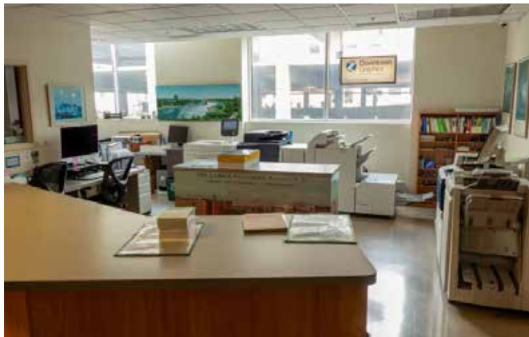
Zenger Downtown Printing