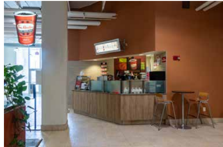
Tim Horton's Express