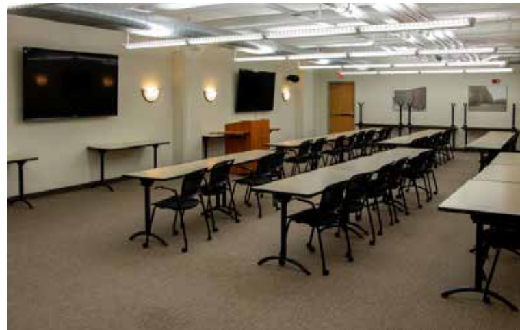
Barton Conference Room