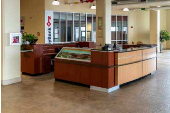
Welcome Lobby + 24 hour staffed security desk