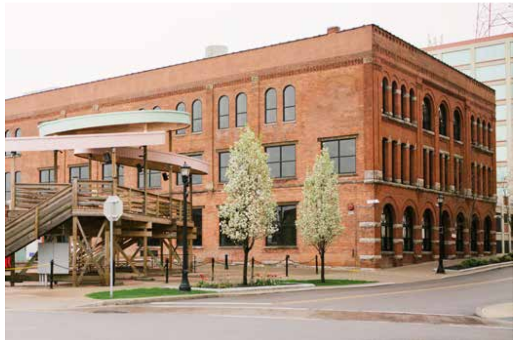
The Larkin U Building