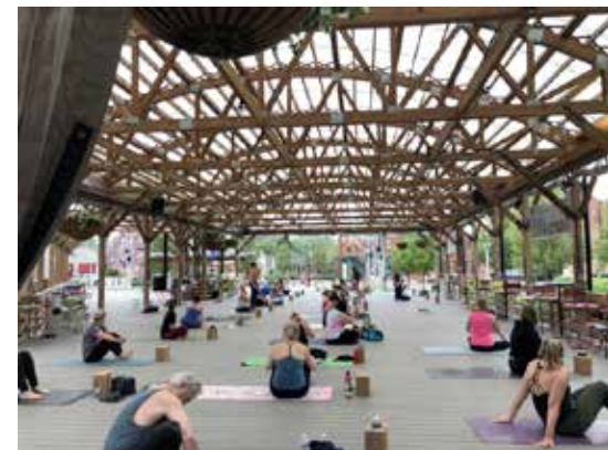
Space on Seneca offers outdoor yoga classes in Larkin Square. Fitness in the Parks also offers free fitness classes in the Square.