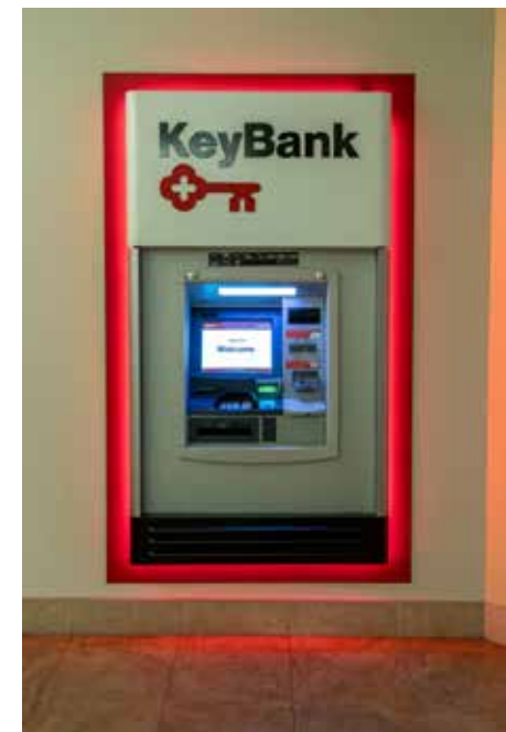
KeyBank Branch and ATM