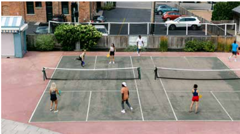
There are two pickleball courts in Larkin Square available for employees to use.