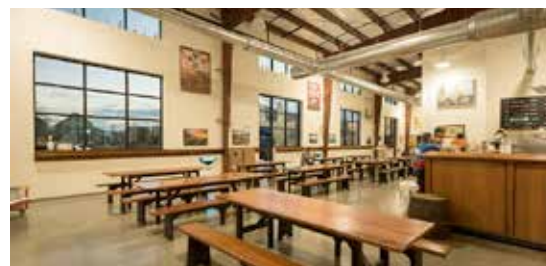
Flying Bison Brewery. Host to a variety of events.