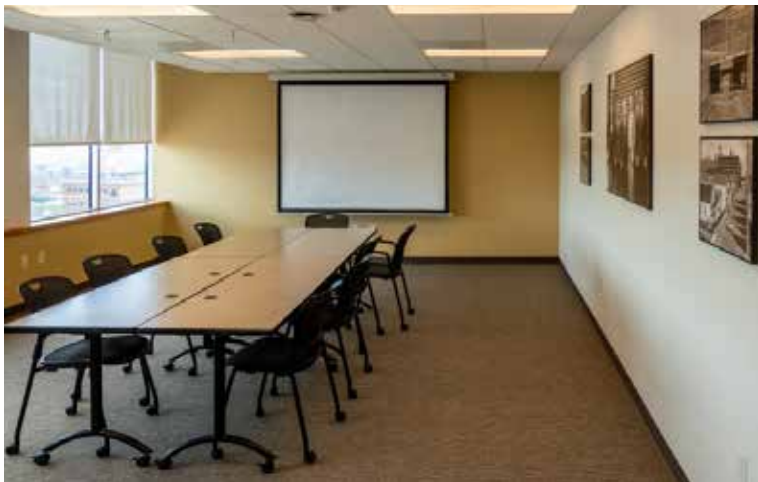
Heath Conference Room