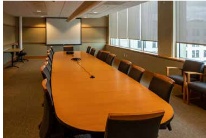
Martin Conference Room