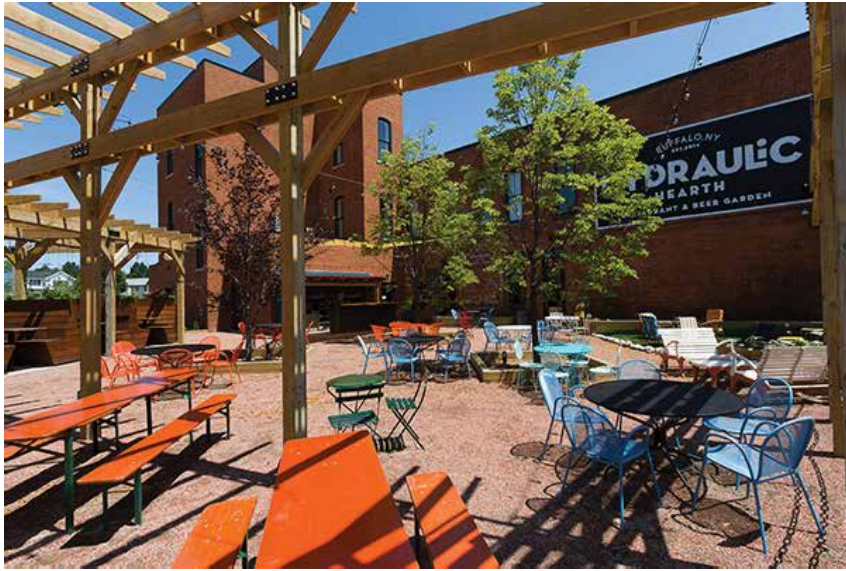
The Hydraulic Hearth Restaurant and Beer Garden.

Located across and down the streets from the Larkin U Building are numerous destinations and activities for employees to enjoy at lunchtime and after work.