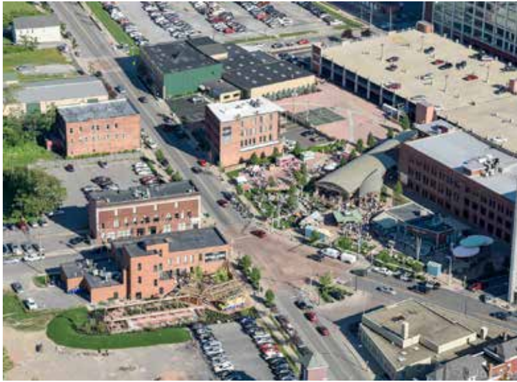
Aerial view of Larkin Square, the Larkin U Building and the Hydraulic Hearth.

Larkin Square, located adjacent to the Larkin U Building, offers after work events such as Food Truck Tuesday, Live at Larkin Concerts, free fitness classes, markets and more!