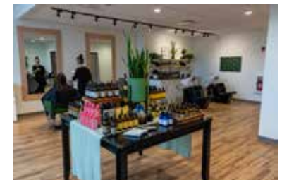
Breathe Organic Salon