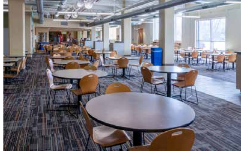
Breakfast and Lunch Cafeteria