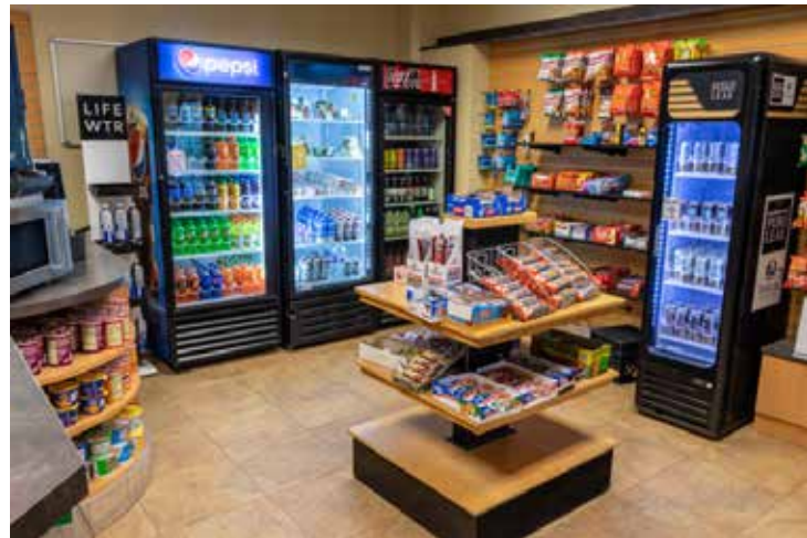
Convenience Store, open 24/7 for tenants