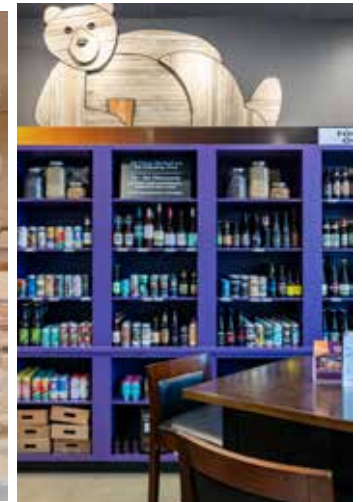
Magic Bear Beer Cellar