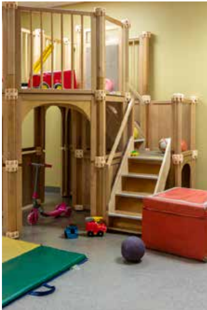
Onsite Daycare, operated by the Valley Community Association