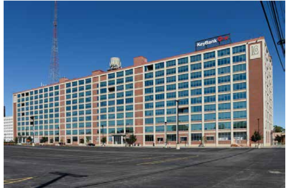
The Larkin at Exchange Building

Businesses choose to locate their offices in Larkinville to enjoy Class A office space and great tenant amenities along with a vibrant work/play/live neighborhood. Businesses find working in Larkinville to be a great recruiting tool.