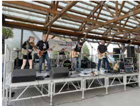
Live Music after work during the summer in Larkin Square.